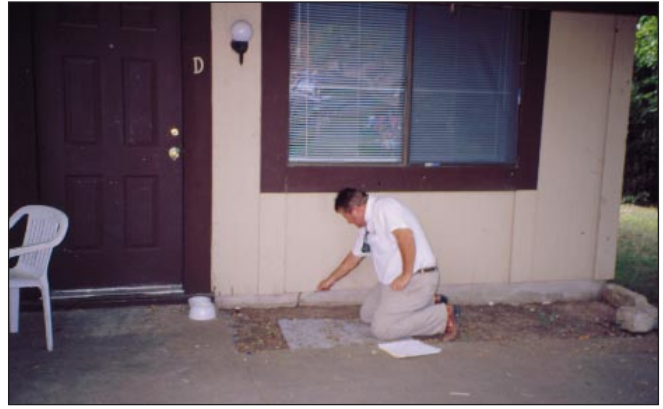
Request a termite inspection from at least three companies.

Consumers shopping for termite control services have more choices than ever before. This is good, but it can also be confusing. Options include baits and soil barriers for subterranean termites, and fumigants and heat for drywood termites.