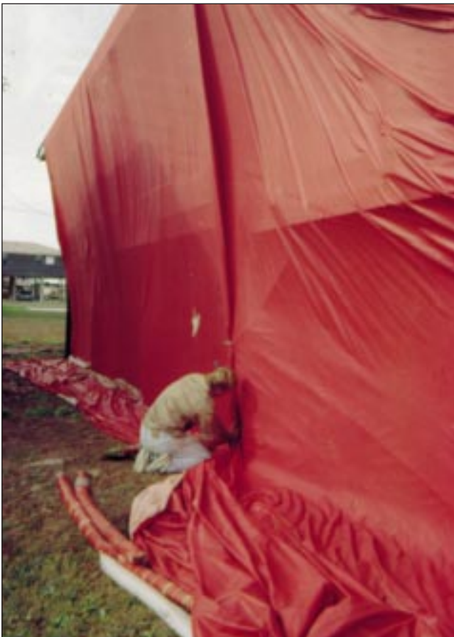
Fumigation is used to treat drywood termites.

(see example at the end of this publication)