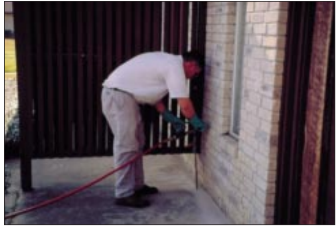
Termiticide is injected in drill holes.

Foam , a relatively new technology, is used to apply termiticide to various construction features of a home. This formulation should be used to treat difficult areas such as chimney bases, dirt-filled porches and certain sub-slab areas. It is not