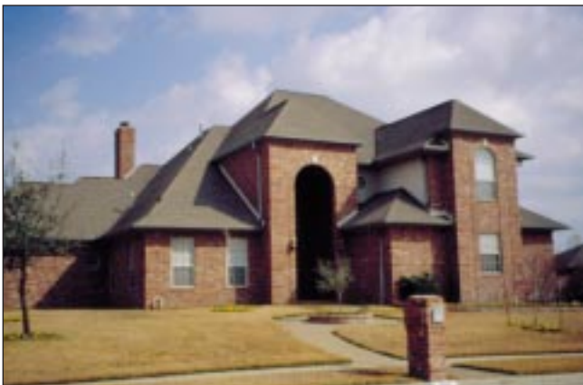
Homes are prime targets for termites.

Do not permit anyone to rush you into buying termite control services. Take the time you need to make an informed decision. Delaying a few weeks makes no difference. There is always time to buy this service wisely and at your convenience.