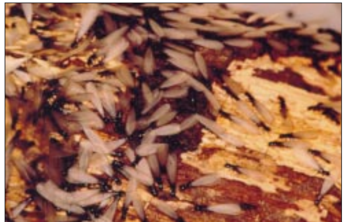
Termites may even begin attacking a home soon after construction.

Wooden structures in Texas have more than a 70 percent chance of being attacked by termites within 10 to 20 years. Termites may even begin attacking soon after construction. Properly treating the soil beneath and around the foundation with termiticidal chemicals before construction, called a pretreatment, reduces the threat of subterranean termites. However, because few areas