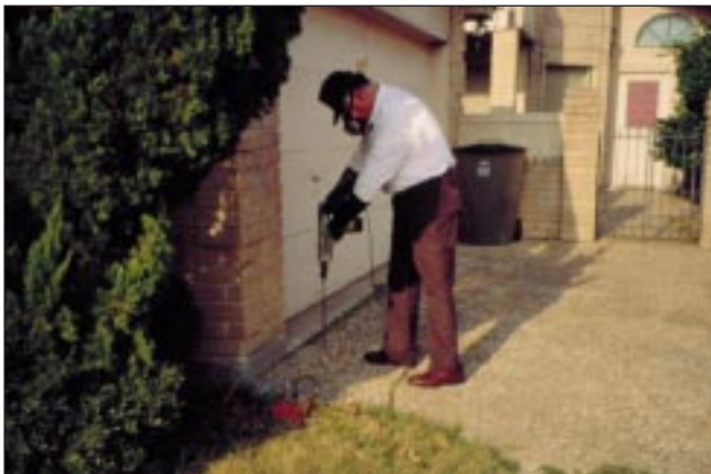
A rotary hammer drill is used to drill holes for the sub-slab method of termite treatment.

Combinations are sometimes used involving all three of the above methods. Sub-slab injection may be used on porches, patios, breezeways, driveways and entryways where separate slabs