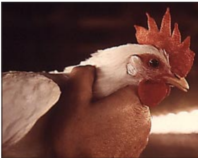
A good quality Leghorn type hen in early production.

Chicks should have 1 square foot of floor space per bird. Put at least 4 inches of litter on the floor of the cleaned, disinfected pen or house. Never place chicks on a slick surface such as cardboard, plastic or newspaper. Wood shavings, cane fiber, ground corn cobs, peanut hulls or rice hulls make good litter. Hay makes very poor litter and should not be used. Stir the litter weekly with a hoe to prevent packing.