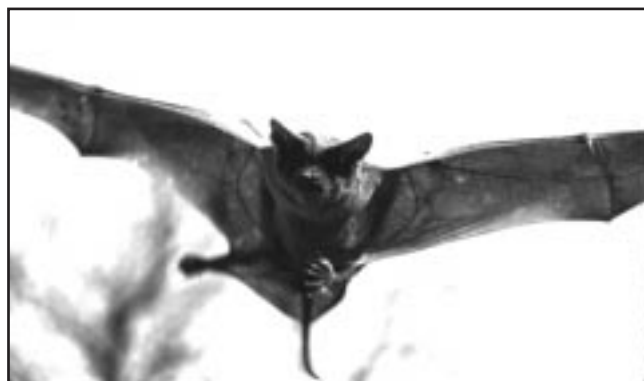
Mexican free-tailed bat.